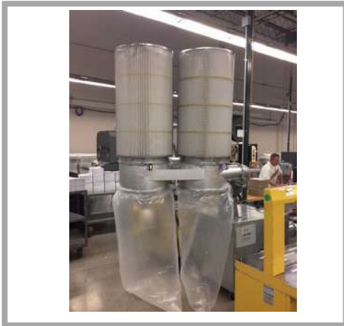
The AirFlex with independent pedestal mounted controls + standard dust containment