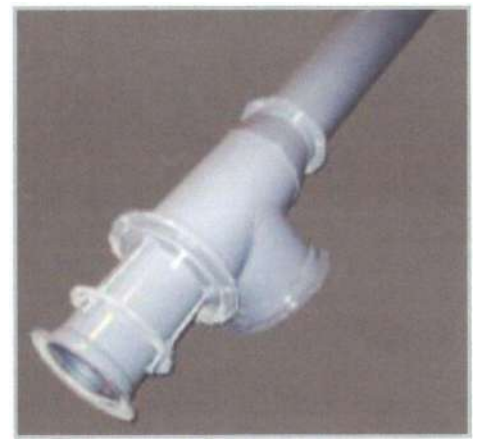
Standard AirTrim Adjustable Venturi in 3" to 8" diameters with air flow adjustment commonly used in Paper, Film, Foil & Plastic