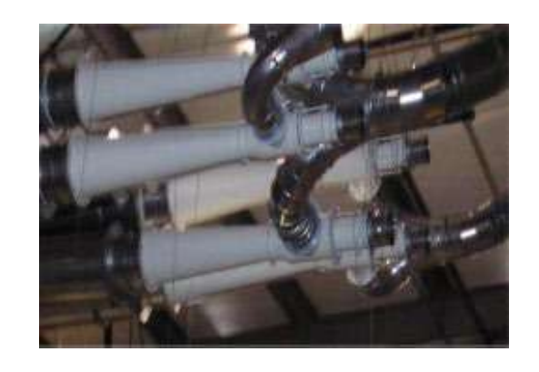
Multiple Adjustable Inducer installation